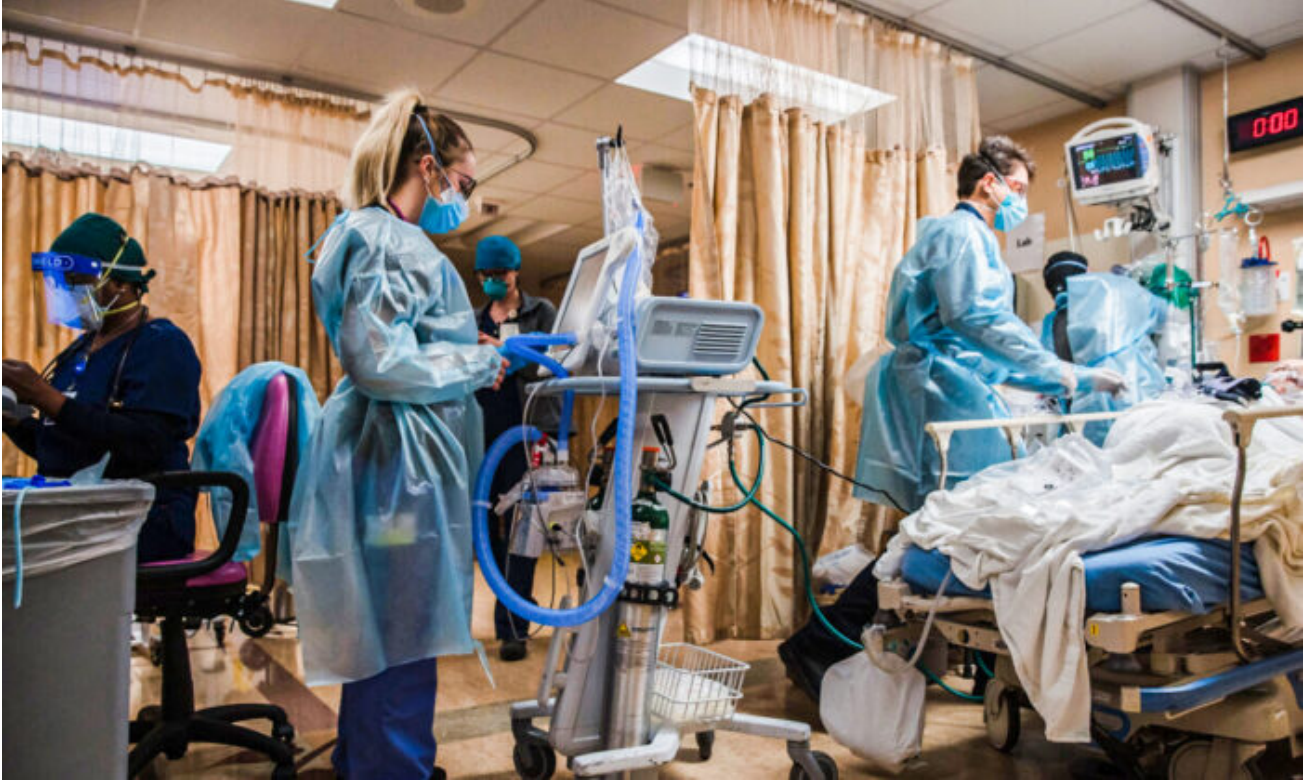
Healthcare workers are seen in a recent file photo.